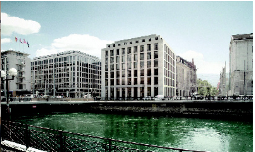
View from quai de l'île